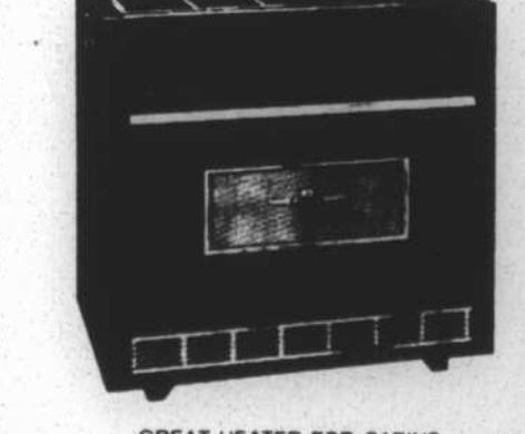
GREAT HEATER FOR CABINS, EFFICIENT ATTRACTIVE HEATER COTTAGES, WORKSHOPS, ETC.