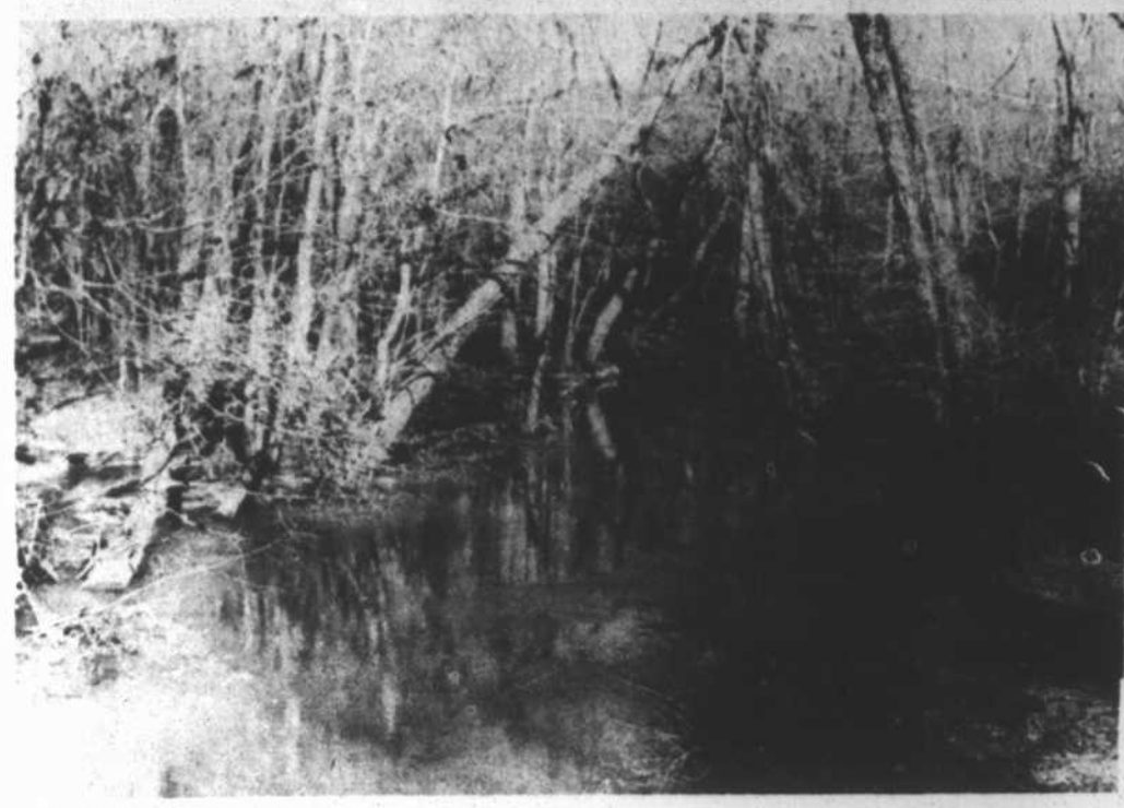
FROZEN OVER-This section of Fishing Creek was turned into a lane of ice this week as temperatures dipped to record lows. The mercury dropped to a minus one degree early Monday