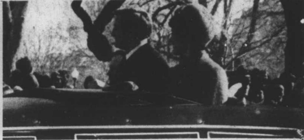
Vice President And Mrs. Walter Mondale Wave To Crowd