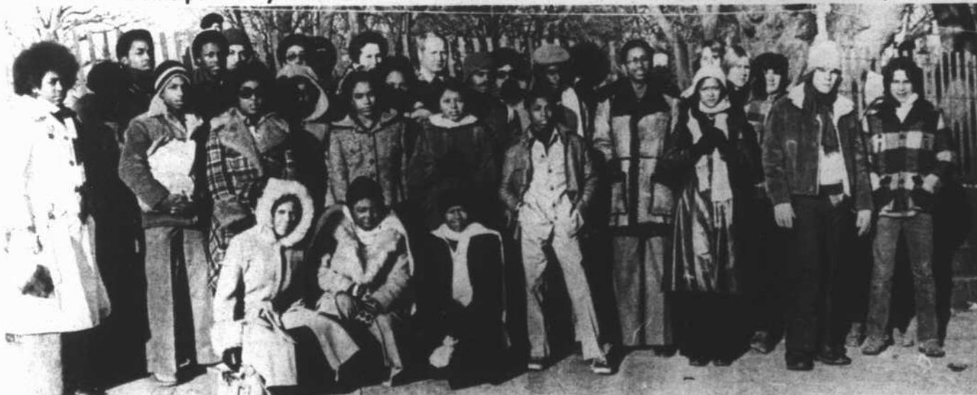
These Students Made Trip To Washington