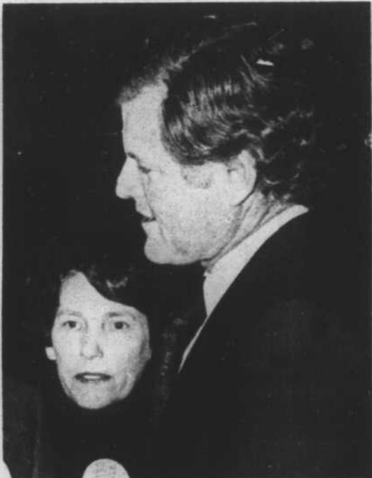
Senator Ted Kennedy