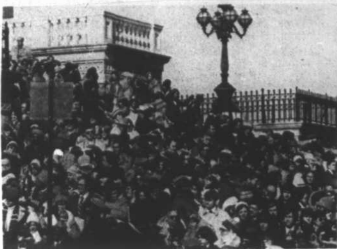
Part Of Inaugural Crowd