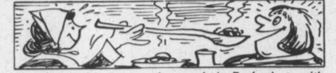
Four hundred years ago the people in England ate with large, long-handled spoons similar to the ones we now use for stirring.