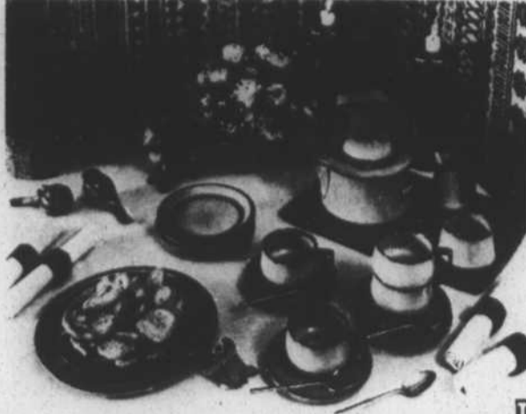
AN ELEGANT TABLE includes extra decorative touches such as charming stoneware figures and sturdy stoneware dishes, all with the look of Danish good design.

Many successful hostesses have found that one secret to getting a gathering off to the right start is to start with the right setting for the table.