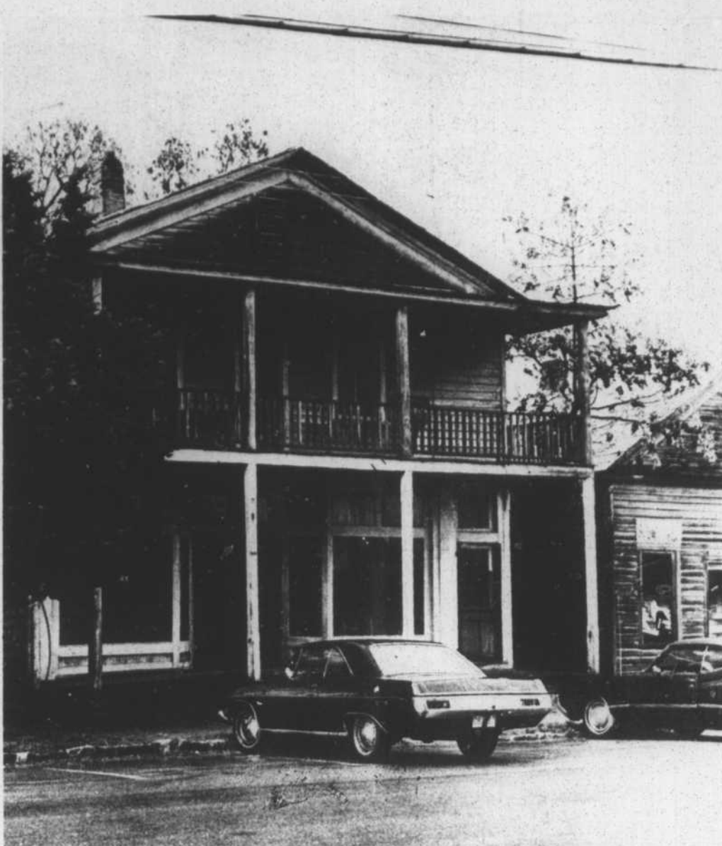
Norlina Board Wants This Old Building Removed