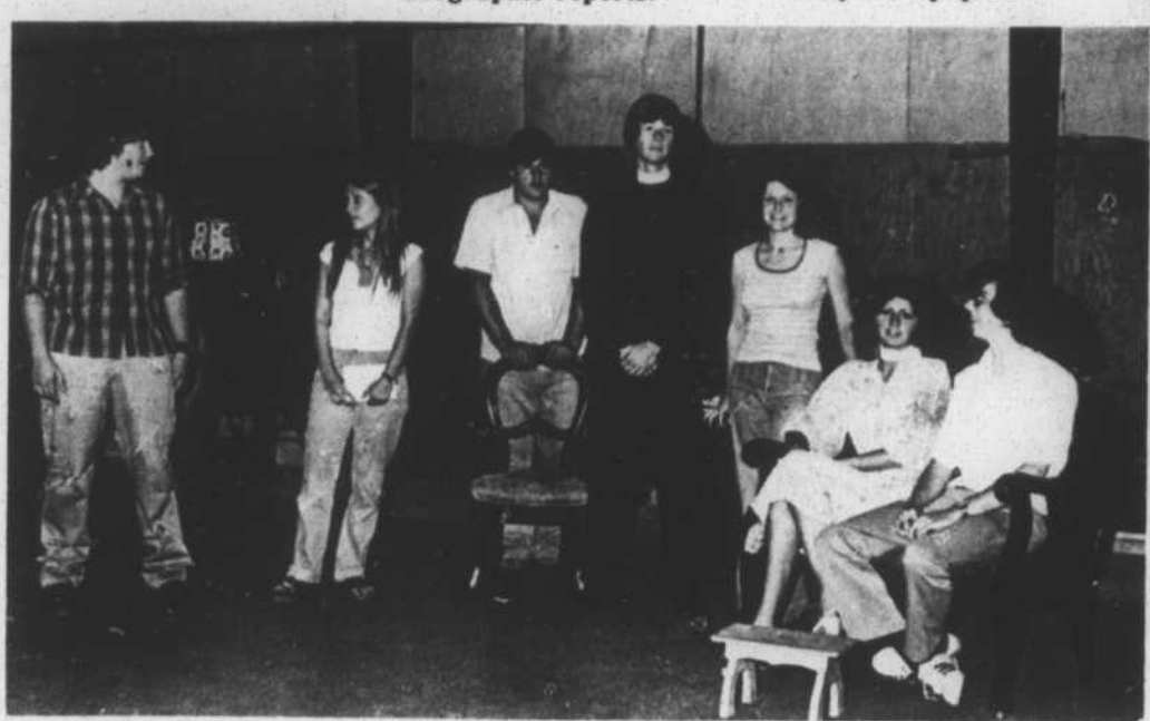
Students in Warren Academics' Drama Club practice for their spring production of "The Admirable Crichton" to be presented Friday and Saturday night at the school.

Many thanks to all who made the "Hee Haw — JG Style" performance a grand success, participants as well as patrons. A lot of hard work went into the show, but the workers and watchers alike enjoyed it and had a lot of laughs. Thanks to all! Two trips are scheduled for Friday, May 6. The French classes will be visiting Tryon Palace in New Bern and the Library Club will be making their annual trip to the University of North Carolina at Chapel Hill.