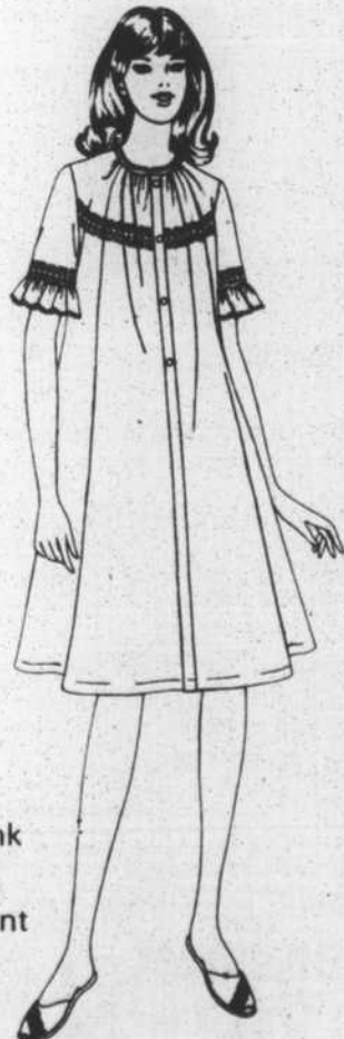
Brite Pink and Brite Mint