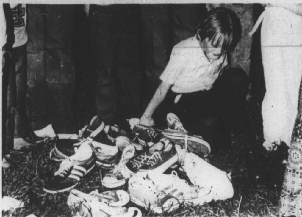
Children who bought a ticket to play in the air bubble at the circus had to take off their shoes before going into the huge bubble. This little fellow has finished playing and must find his shoes.