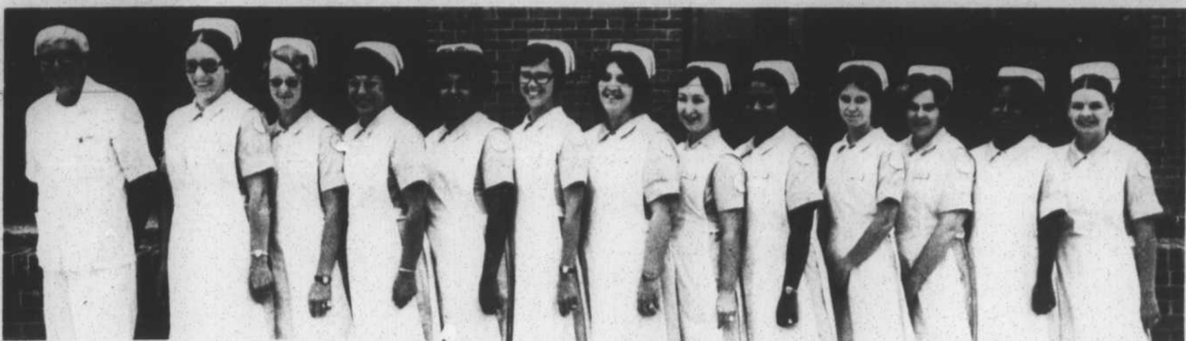
These thirteen members of Vance-Granville Community College's Practical Nursing Class received caps in recent ceremonies. The capping ceremony marked completion of half the course work for a diploma in nursing.

The grant covers the period from April 1 to September 30. The workshops will begin in late May and continue through the summer months.