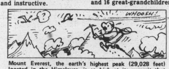
located in the Himalayas, is so high at its summit that it penetrates the jet stream. Winds that sometimes reach 200 mph blow snow from its peak.