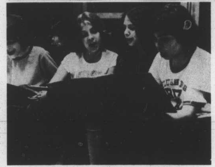
SING, SING...These children put in long hours at a New York recording studio preparing an album of children's songs for UNICEF, the United Nations Children Fund. The album is entitled Sing Children Sing and the youngsters are members of the New York City Opera Children's Chorus.