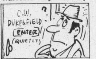
W. C. Fields' real name was Claude William Dukenfield.