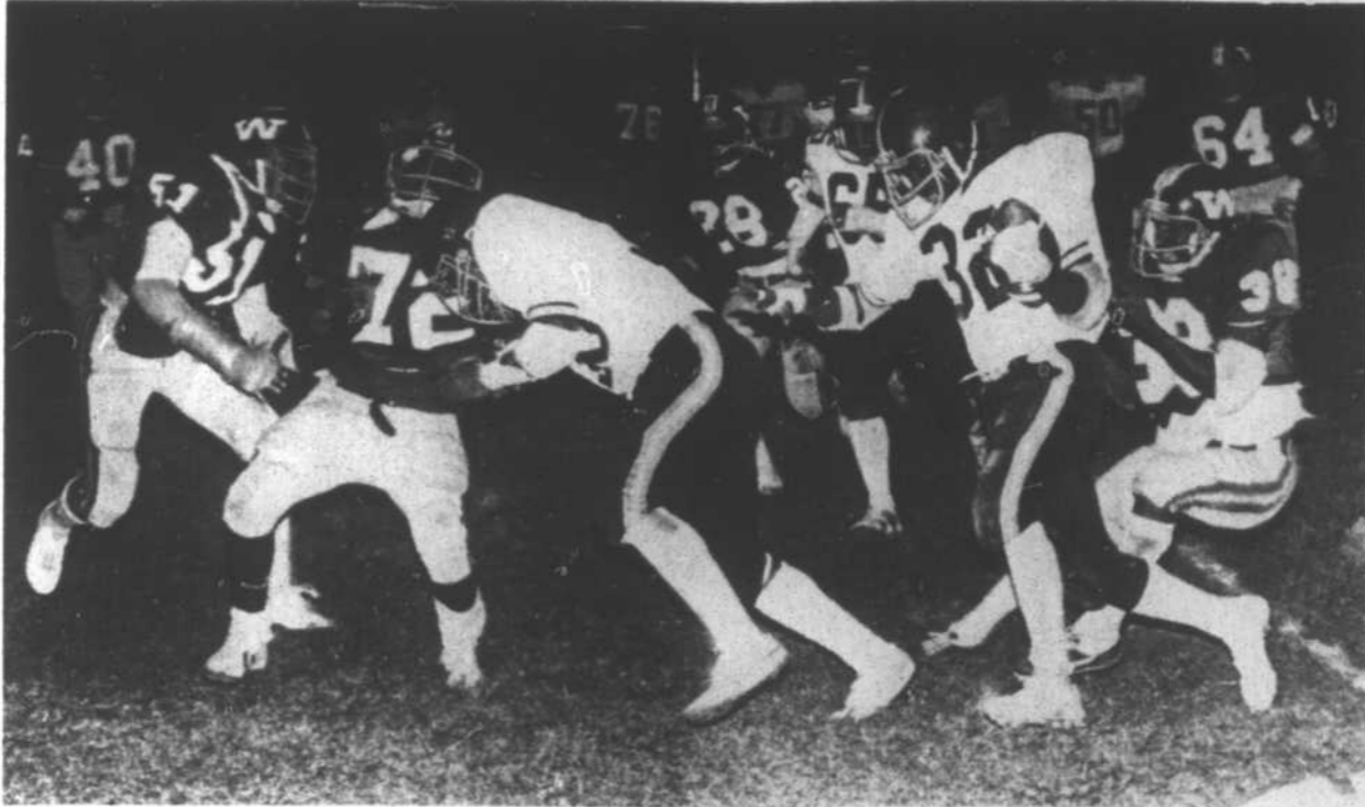
The Eagles' "Brick Wall" defense rises to the occasion Friday night, stopping this East Northampton back for no gain. The Eagles won the conference

Warren County 50 East Northampton 16 West Northampton 39 Weldon 6 Bertie Co. 37 Plymouth 0 Tarboro 20 Edenton 13 Roanoke Rapids 20 Roanoke 6 Washington 46 Williamston 6 Franklinton 8 Bunn 0 Fuquay-Varina 58 Louisburg 8 Oxford-Webb 18 S. Johnston 14 E. Northampton JV 18 Warren Co. 6 Norlina 16 Gaston 14 Weldon 36 John Graham 6