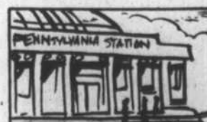
New York City's massive Pennsylvania Railroad Station was originally modeled after the ancient Roman baths of Caracalla.