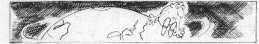
The earth rotates on its axis more slowly in March than in September.