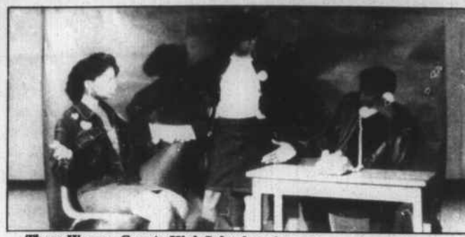
These Warren County High School students gave a dramatic presentation for persons attending "A Night of the Arts" on Thursday of