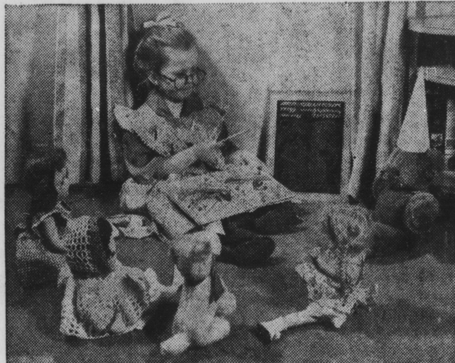
Pictures of children in a favorite play situation add interest to family albums.