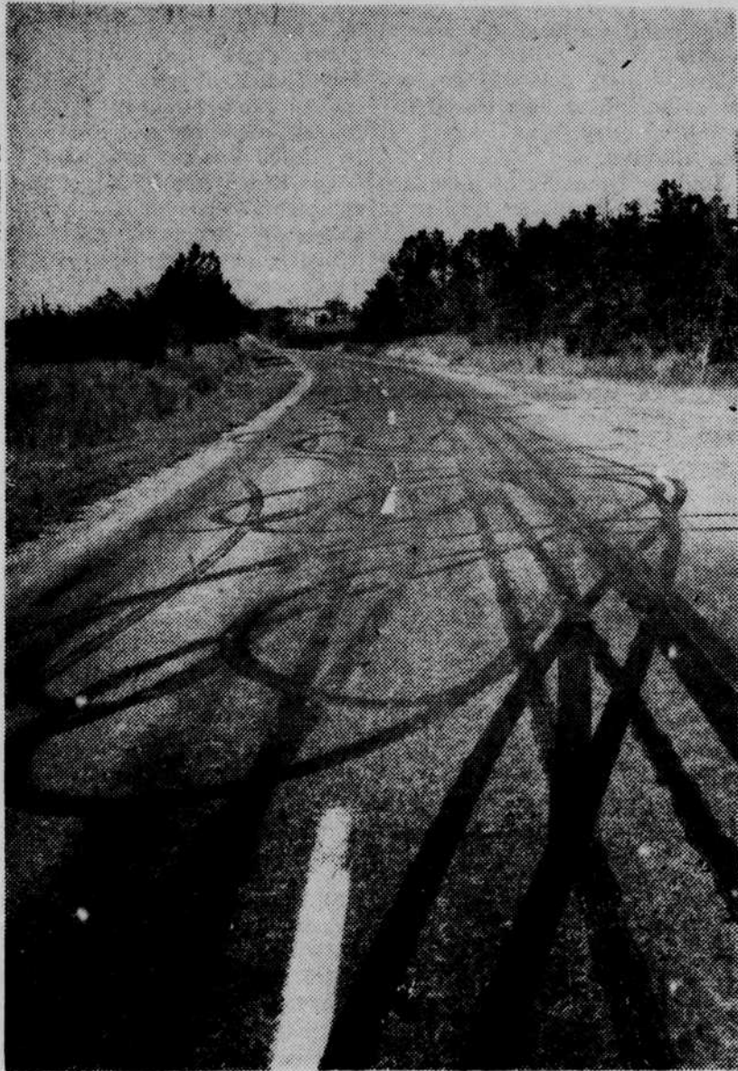
Drag racers cut these hashmarks in a road near Oakboro with the kind of driving that has dozens of Tar Heel communities jittery.