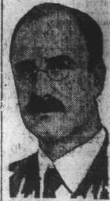
Portrait of a man, likely the author or a subject of the article.

TEXT—The elder unto the elect lady, II John 1.