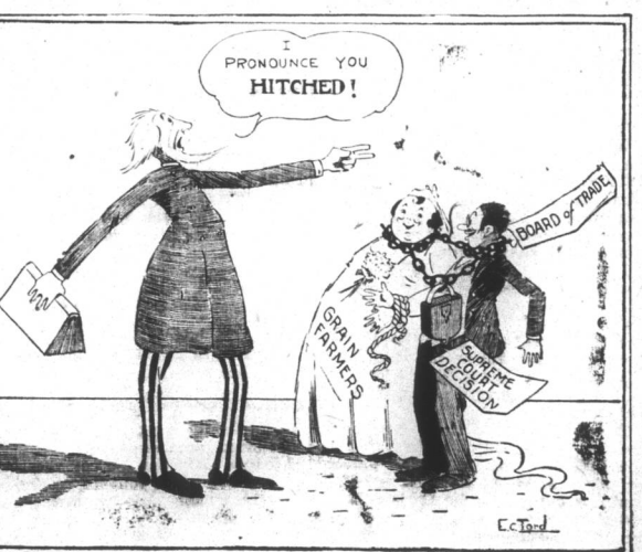
The bride looks more pleased than the groom, but we think he'll get to like matrimony better as he gets used to it. Cartoon from The Farm Journal, August 1923.

Have you visited the hardware store? If not you are missing a treat. We have a new and up-to-date line of Hardware, a complete line of pocket cutlery, scissors and shears, tools, builders' hardware, house furnishings, bicycles, sporting goods, automobile tires and tubes, sole agents for Lowe Brothers paints and varnishes, a complete line of farm implements, repairs for Lynchburg, Oliver and Chattanooga points and repairs, and all kinds of lubricating oils and greases. Quality Reigns Supreme at This Store. RITCHIE-CALDWELL CO. 25 S. Union St. Concord, N. C.