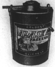
Refrigerator Exactly Like Cut, Alaska Ice Cream Freezers One-reduced to $32.50 Third Off.