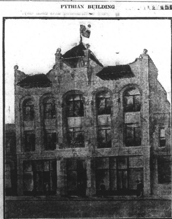
Home of a Number of Fraternal Organizations.