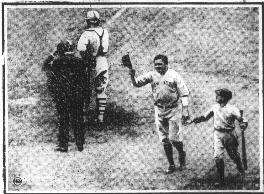
When Babe Ruth completed his first home run at the Polo Grounds in the second inning of the second game of the world series, the cheers from the stands were so great that the Babe just couldn't keep from doffing his cap. If a ballplayer ever registered "happiness," he is doing it in this photograph of Ruth.