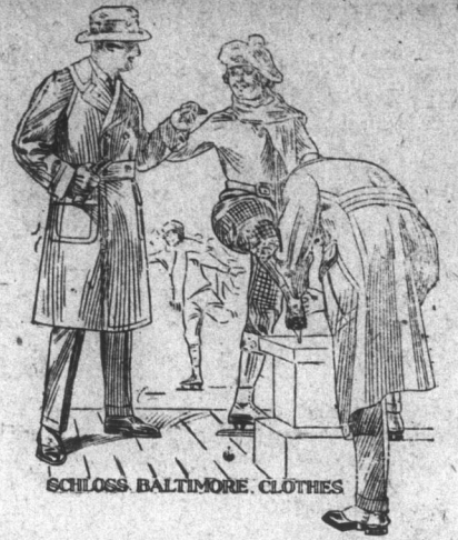
SCHLOSS BALTIMORE, CLOTHES

We Will Give the Progressive Farmer a whole year free to every subscriber to The Times who pays a year in advance for 100, including plate. Call and see The Times, Concord, N. C.