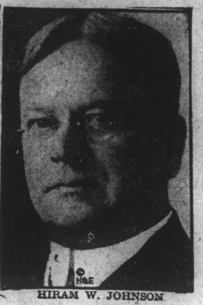
HIRAM W. JOHNSON Who on Thursday Announced His Candidacy for Presidential Nomination.

Fair tonight and Saturday; no change in temperature.