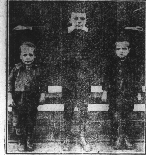
Compare the American boy of eight years as shown in center, with the two German lads of the same age. The caption accompanying the photo stated the German boys were undernourished, though their faces do not show signs of suffering particularly.