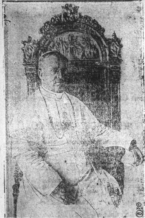
THE HOLINESS Pope Pius XI does not seem to have aged any since his election to the high office.

These photographs were taken after negotiations extending over many months. Pope Pius gave special permission to enter parts of the Vatican where a camera had never been before. These pictures, together with the latest posed photograph of the Pope, will compel the interest of every newspaper reader. This is the most comprehensive preparedness service on the Vaticana ever issued to a newspaper.