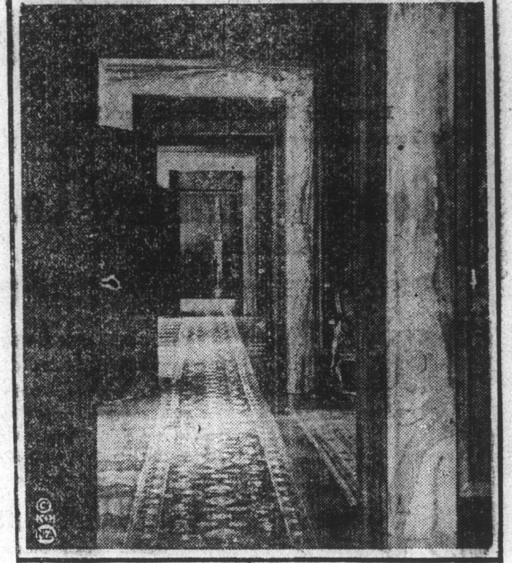
No picture could give you a clearer conception of the interior of the Vatican. Each room opens into another one, as the photo plainly shows.