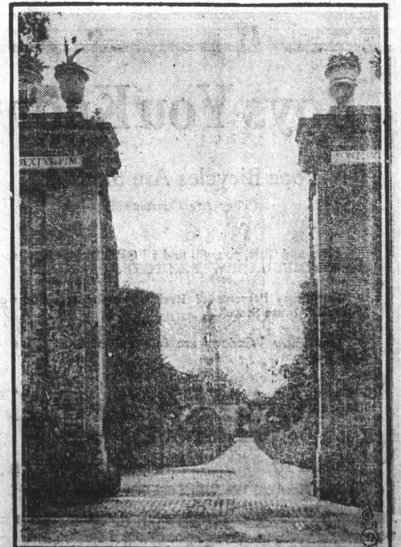
Into this beautiful walk the Pope of the times. It shows the Virgin Mary of Lourdes in the Gardens. Here His Holiness often prays in the course of a walk.