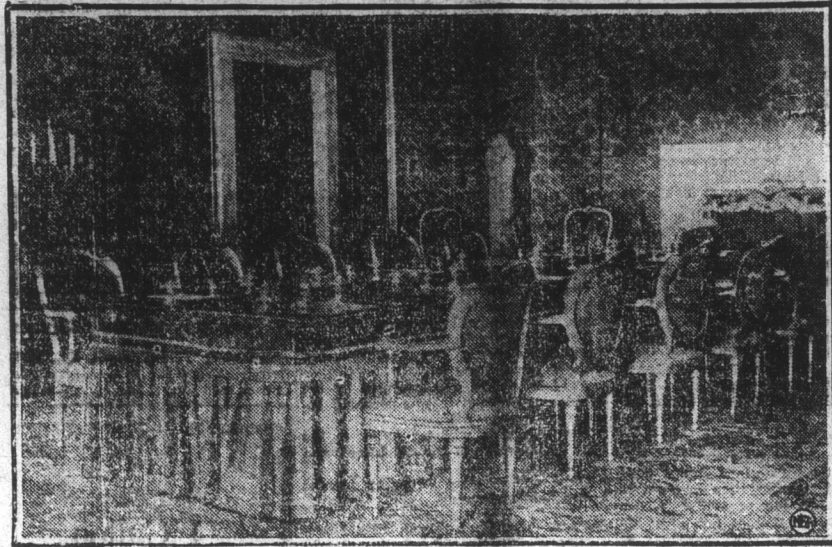
This may remind you somewhat of the cabinet room where our President meets his chief advisors. The photo shows the private meeting room where the Pope confers with the Cardinals, and affairs of the Catholic world are settled.