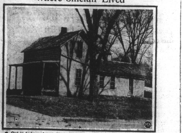
● Out in Independence, Kas., they still call Harry F. Sinclair, oil king, "Harry." Photo shows the Sinclair home, as it was during the magnate's boyhood.