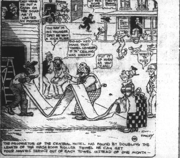
THE PROPRIETOR OF THE CENTRAL HOTEL HAS FOUND BY DOUBLING THE LENGTH OF THE WASH ROOM ROLLER TOWEL HE CAN GET FOUR MONTHS SERVICE OUT OF EACH TOWEL INSTEAD OF ONE MONTH.