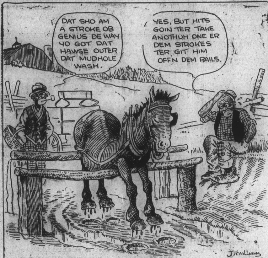
THE UNFINISHED MASTER PIECE.