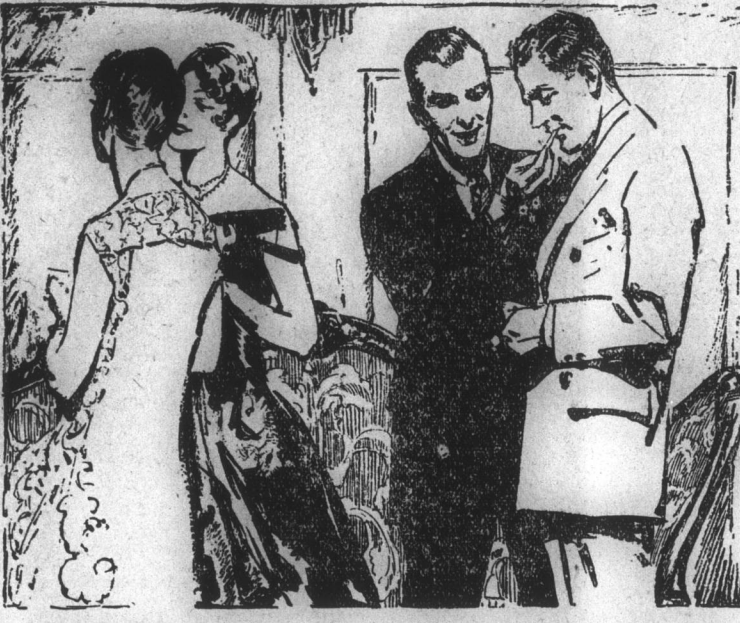
Into the making of this one cigarette goes all of the ability of the world's largest organization of expert tobacco men. Nothing is too good for Camels. The choicest Turkish and domestic tobaccos. The most skilful blending. The most scientific package. No other cigarette made is like Camels. No finer cigarette can be made. Camels are the overwhelming choice of experienced smokers.

When you entertain at home—and the sumptuous feast has been greeted with royal praise by the laughing, pledging friends—have a Camel!