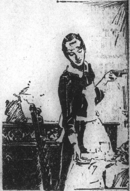
Our highest wish, if you do not yet know Camel quality, is that you try them. We invite you to compare Camels with any cigarette made at any price. R. J. Reynolds Tobacco Co.

WHEN invited guests come in for dinner. And the festive board resounds with joyous words of friendship. When the primest feast ever served is finished—then, how welcome are those words of hospitality—"Have a Camel!" For no other cigarette was ever so fitly smoked and served to others as Camel. Camel goodness insures a fitting climax to every perfect spread, adds of its own fragrant welcome to every home's bright occasions. Camels are made of the choicest tobaccos grown in all the world. They never tire the taste, never leave a cigarette after-taste. Fragrance and mellowness have made Camel the greatest word in all the history of smoking. So this night, as you learn anew the joys of giving happiness to others. As after-dinner laughter rings out through all the house—know then the pleasures of smoking and serving the finest. You may be doubly sure that every good feature is rolled into Camels that anyone ever searched for in a cigarette. Have a Camel!