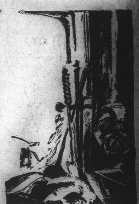
R. J. Reynolds Tobacco