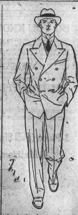
This doesn't mean that the mit, like all suits, won't need the coat when it is hung up will deaning and pressing at proper help materially in keeping it ntervals. But, in between the looking smart and trim.

Lots of them do sag because Lots of them do sag because the wearers don't know how to teep them in shape. According to Hart Schaffner & Marx experts, the most effective way to teep a double-breasted coat in hape is to button it over the tanger each night—not only the justide buttons, but the inside in "anchor" button as well. This document that the