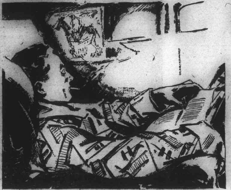
No other cigarette in the world is like Camels. Camels contain the choicest Turkish and domestic tobaccos. The Camel blend is the triumph of expert blenders. Even the Camel cigarette paper is the finest—made especially in France. Into this one brand of cigarettes is concentrated the experience and skill of the largest tobacco organization in the world.

WHEN it's a winter night and the day that was busy is done. And outside the snow is driving through the trees before the wind. When, inside, the crackling logs catch fire and burst into flames above the hearth-have a Camel!