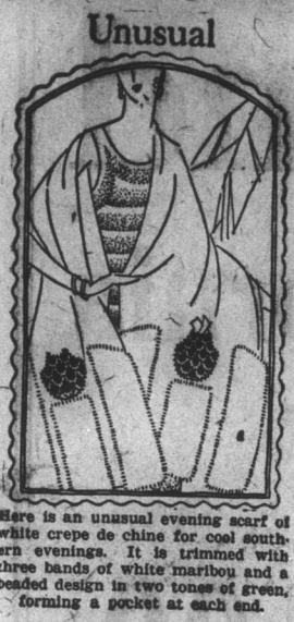
Here is an unusual evening scarf of white crepe de chine for cool southern evenings. It is trimmed with three bands of white maribou and a beaded design in two tones of green, forming a pocket at each end.

Send in Society Items for Tribune. Friends and patrons of The Daily Tribune are asked to mail or phone in personals and other social items.