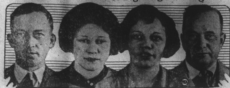
With the return of two men and two women from Chicago to Flint, Mich., Flint police believe they have broken up one of the most dangerous rings of forgers in the country.