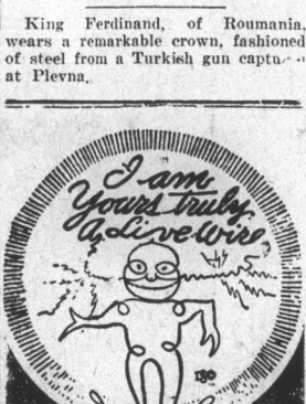
For each man and woman, friend and neighbor I'm A. Live Wire, the labor savior.

King Ferdinand, of Roumania, wears a remarkable crown, fashioned of steel from a Turkish gun captured at Plevna.