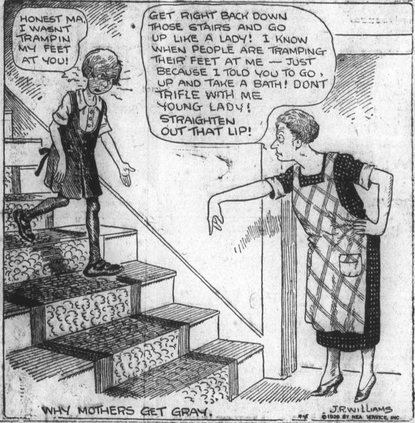
WHY MOTHERS GET GRAY.