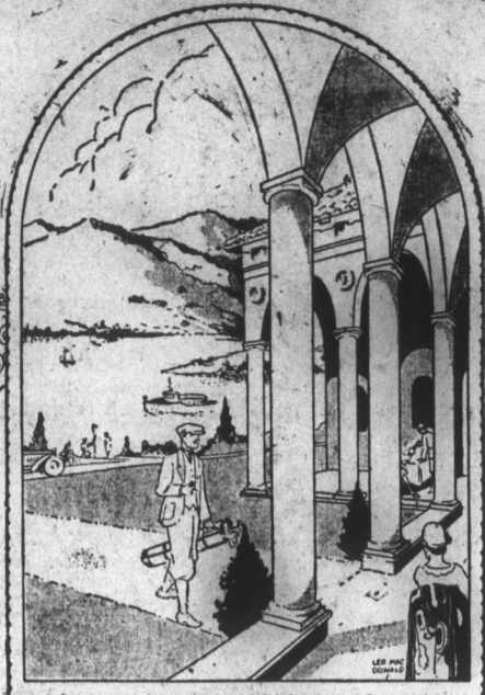
Charming vistas at every turn will rival the world-famed beauty of Como, Garda and Maggiore.