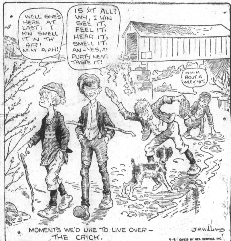
MOMENTS WE'D LIKE TO LIVE OVER - THE CRICK.