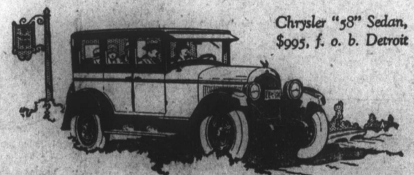
Chrysler "58" Sedan, $995, f. o. b. Detroit

All Chrysler models are protected against theft by the Federal patented car numbering system, pioneered by and exclusive with Chrysler, which cannot be counterfeited and cannot be altered or removed without conclusive evidence of tampering.