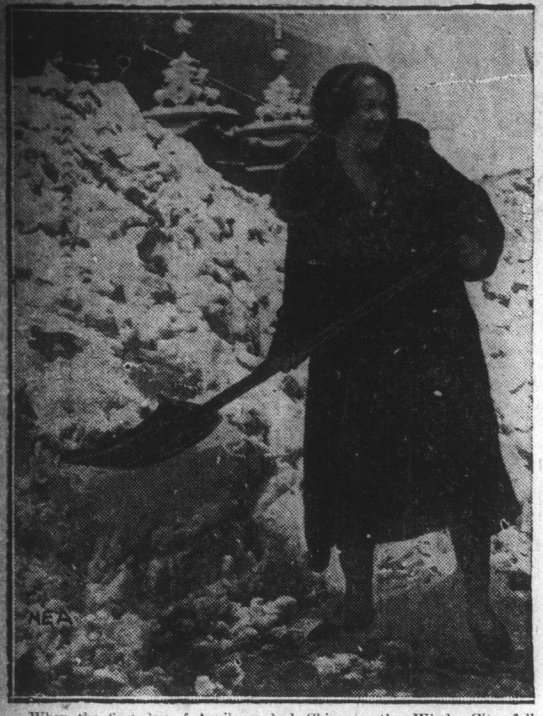
When the first day of April reached Chicago the Windy City folks bught February had returned by mistake. This photo shows how th