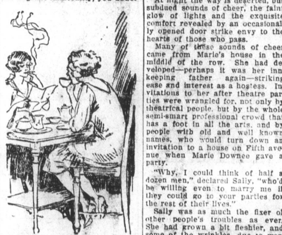
She and Sally sat at the orange and yellow tea stand.

CHAPTER IX—(Continued) She had been such a hit that they had decided to put it up in electric signs finally. Of course her agent had something to do with that and her personal publicity agent to whom a bit of her salary had gone ungrudgingly for some months. She had become hardened to this press agent not permitting the public to forget what she had done so ardently wished to prevent it from learning—