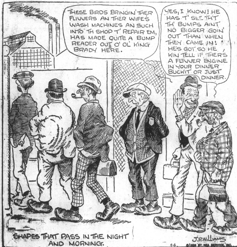
SHAPES THAT PASS IN THE NIGHT AND MORNING.