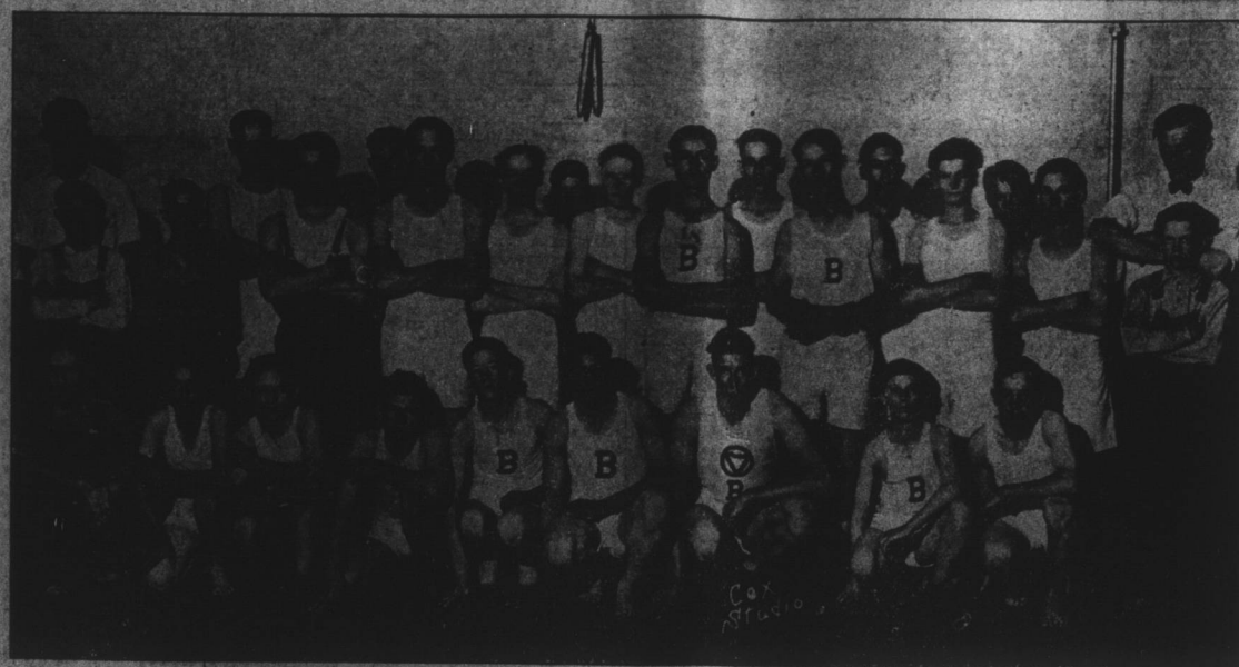
SENIOR EMPLOYED BOYS INDUSTRIAL CLUB