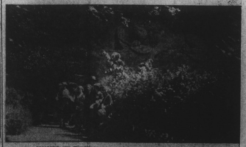
CONCORD "Y" TOURISTS AT LUCERNE, SWITZERLAND IN 1925

We Support Every Worthwhile Concord Institution That's Why We Back the Y. M. C. A. Bell & Harris Furniture Co.