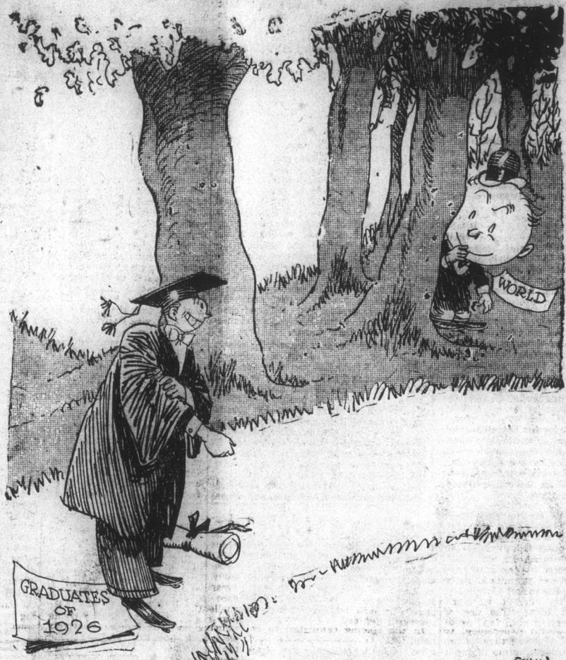
© 1926, by King Features Syndicate, Inc. 5-27 GUN HALL