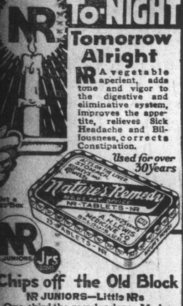
UNIORS-Little NRs the regular dose. Made ingredients, then candy For children and adults. ug Store

your regular dealer can-mpply you, telephone F. M. gblood and Co., wholesale