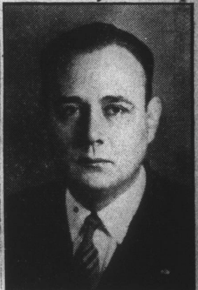
Manager Hotel Concord