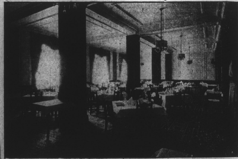
Main Dining Room