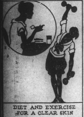
DIET AND EXERCISE FOR A CLEAR SKIN

WHAT is the story your face tells? Are there tired lines and wrinkles? Flabby muscles? Ugly eruptions? Your face is a perfect mirror of the condition of your entire body, and if you have ever looked in this mirror critically, you can see pictured there the story that is no secret to the rest of the world. In matters of health, if a person is organically sound, there are few new ideas. The age-old, simple rules will suffice in most cases. If you want to be beautiful—for robust health is the only safe road to beauty—practice these fundamental rules of health. Moderation should be the keynote. Moderation in eating, working and playing. Nothing is more essential than sufficient rest, plenty of fresh air and sunlight. A prop-