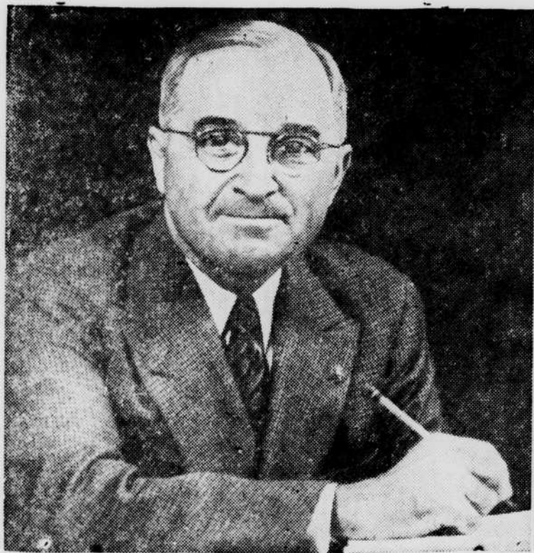
President Harry S. Truman, who told the members of congress yesterday in a joint session, that the position of the U. S. should be made unmistakably clear in the present world-crisis.