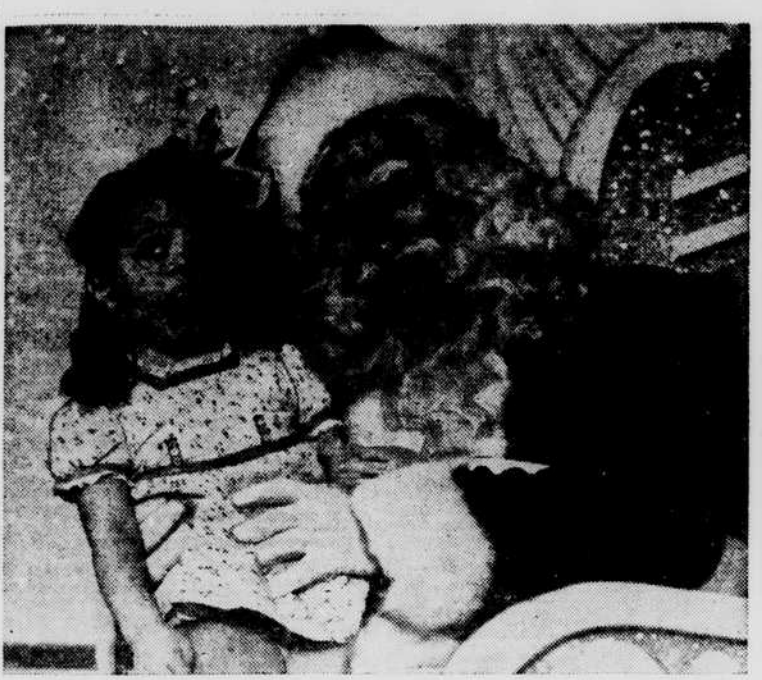
This little girl is telling Santa she has been good. All the children in this area will have an opportunity to do the same when he comes to West Jefferson, Saturday.