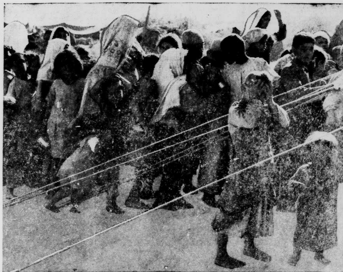
Christmas 1948 finds war and unrest ravaging the Holy Land. Arab refugees and their mothers line up before the tent of the International Refugee Organization to get their rations of milk. The Jericho area has been selected for the site of a huge settlement where all Arab refugees from the Holy Land war will be concentrated. The area was selected because of its warmth during the winter season.